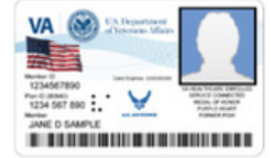
Department of Veterans Affairs