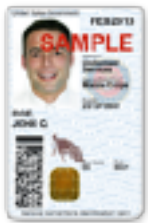
Active Duty Armed Forces

Vendor specific eligibility requirements may apply