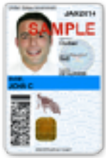
Active Foreign Affiliate (Non-U.S. Citizen)