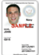
Retired APF and NAF DoD Civilian Employees