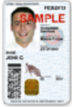
Active Duty Armed Forces