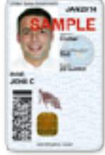
APF and NAF DoD and Uniformed Services Civilian Employees