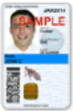
Active Foreign Affiliate (Non-U.S. Citizen)