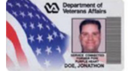
100% Disabled Veteran Guard and Reserve Dependent Active Duty Dependent Reserve Retired National Guard Retired